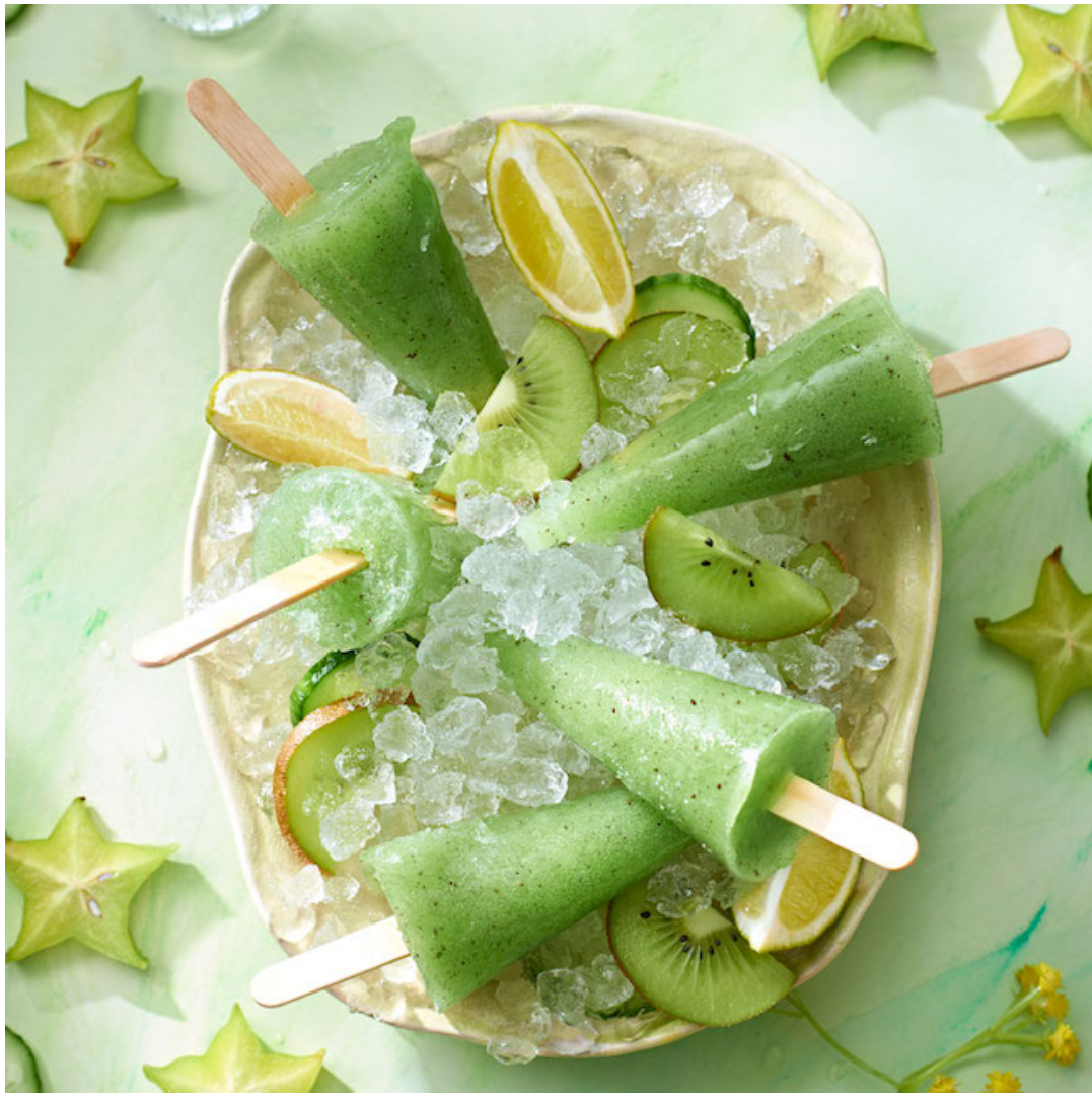
Kiwi, Ginger and Lemon Lollies