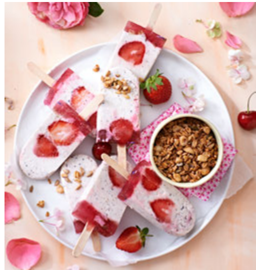
Breakfast Granola Strawberry and Mango Lollies