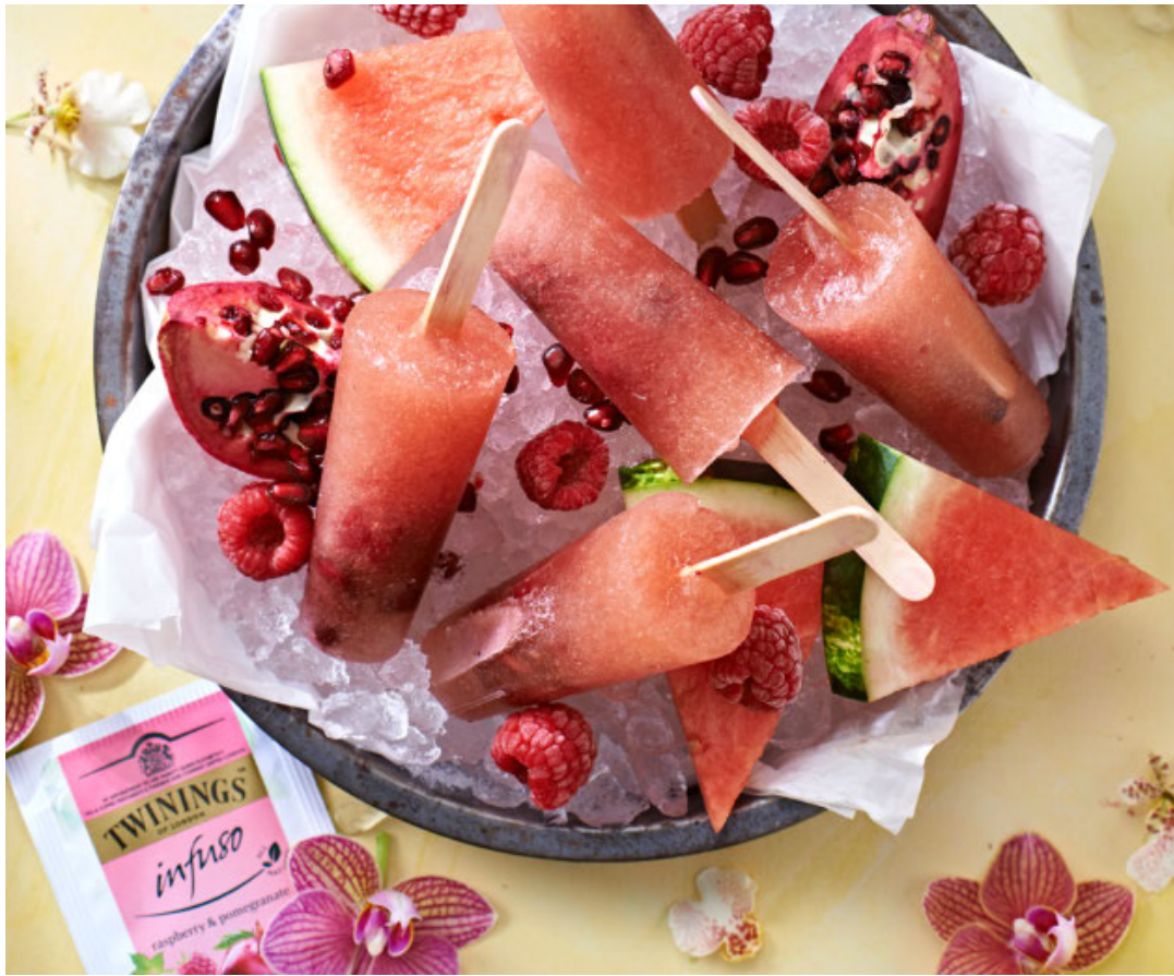
Pomegranate and Raspberry Lollies