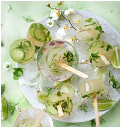
Fennel, Mint and Liquorice Lollies